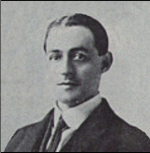
Arthur W. Pink (1886-1952)

During his ministry, A. W. Pink served as a pastor, evangelist and became a prolific writer. His writings helped spark a renewal of expository preaching.