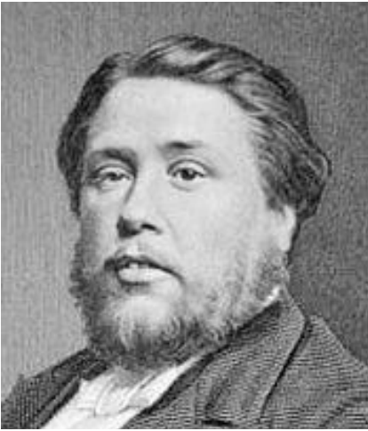
Charles Haddon Spurgeon (1834-1892)

“And shall fear the LORD and his goodness in the latter days.”—Hosea 3:5